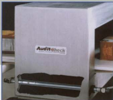
The AuditCheck system automatically activates a test sphere on a programmable timed basis. The ultimate solution for a superior HACCP program.

The DSP3 metal detector is available as a complete conveyor unit, pipeline unit, drop through unit, pharmaceutical unit or for custom application solutions. A wide variety of automatic reject devices are available to meet any customer application requirement.